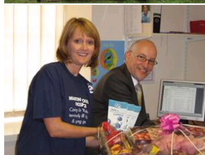
Making The Draw