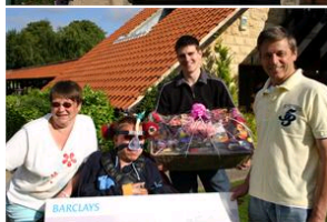
Our Lucky Winners