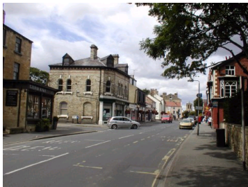
Location of Martin House