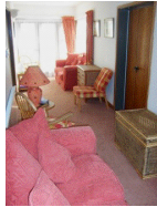
Quiet Family Room