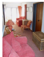
Quiet Family Room